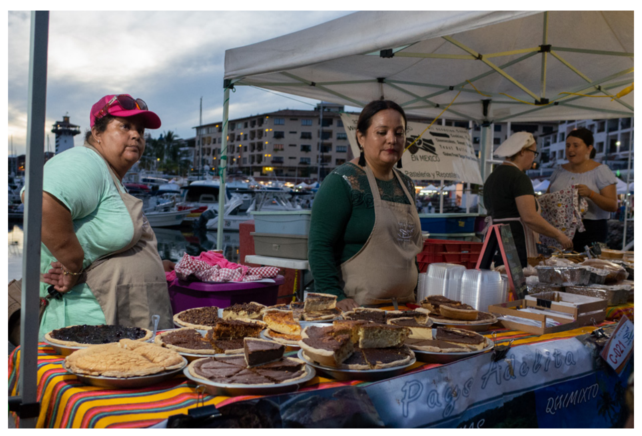
Women operating a stall at an outdoor market in Jalisco, Mexico